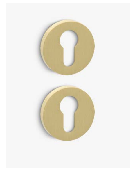
POWERCOAT SATIN BRASS