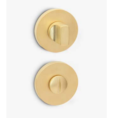
POWERCOAT SATIN BRASS