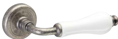
EFFETTO FERRO / WHITE