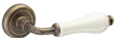
ANTIQUÉ BRASS / IVORY