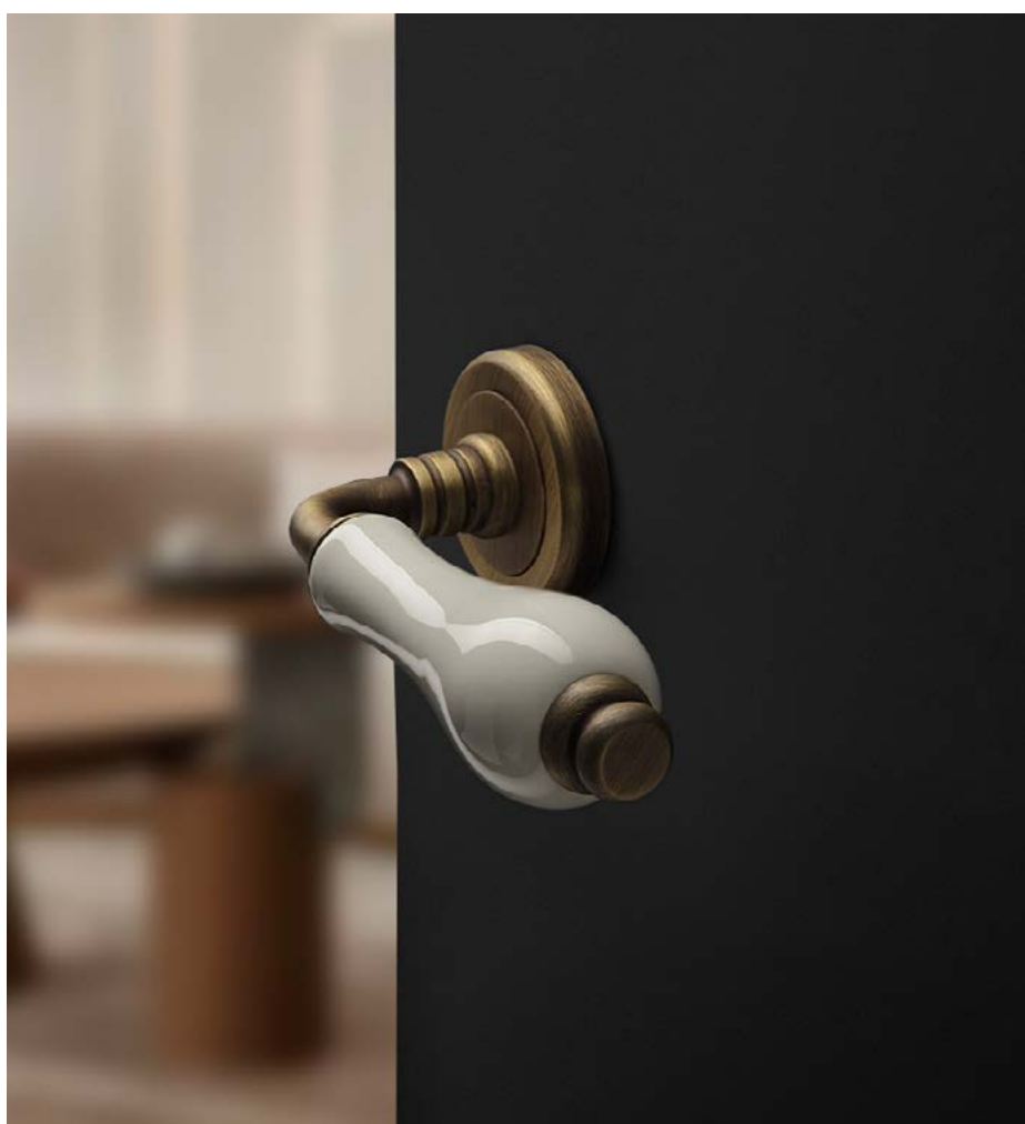
MATT BRONZE / IVORY