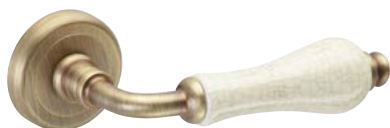
MATT BRONZE / CRAQUELÉ