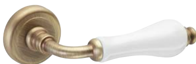
MATT BRONZE / WHITE