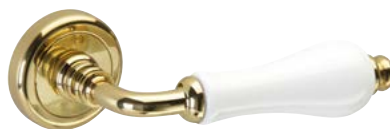
POLISHED BRASS / WHITE