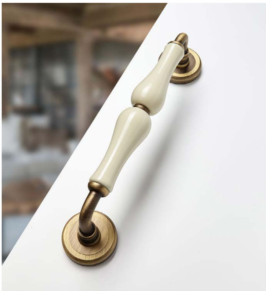
MATT BRONZE / IVORY