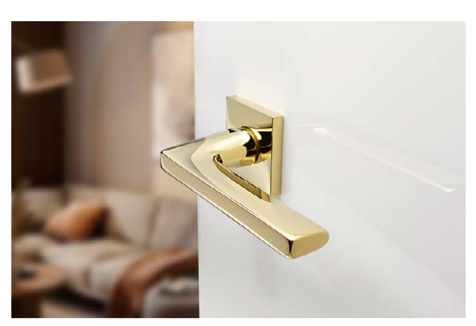
POWERCOAT POLISHED BRASS