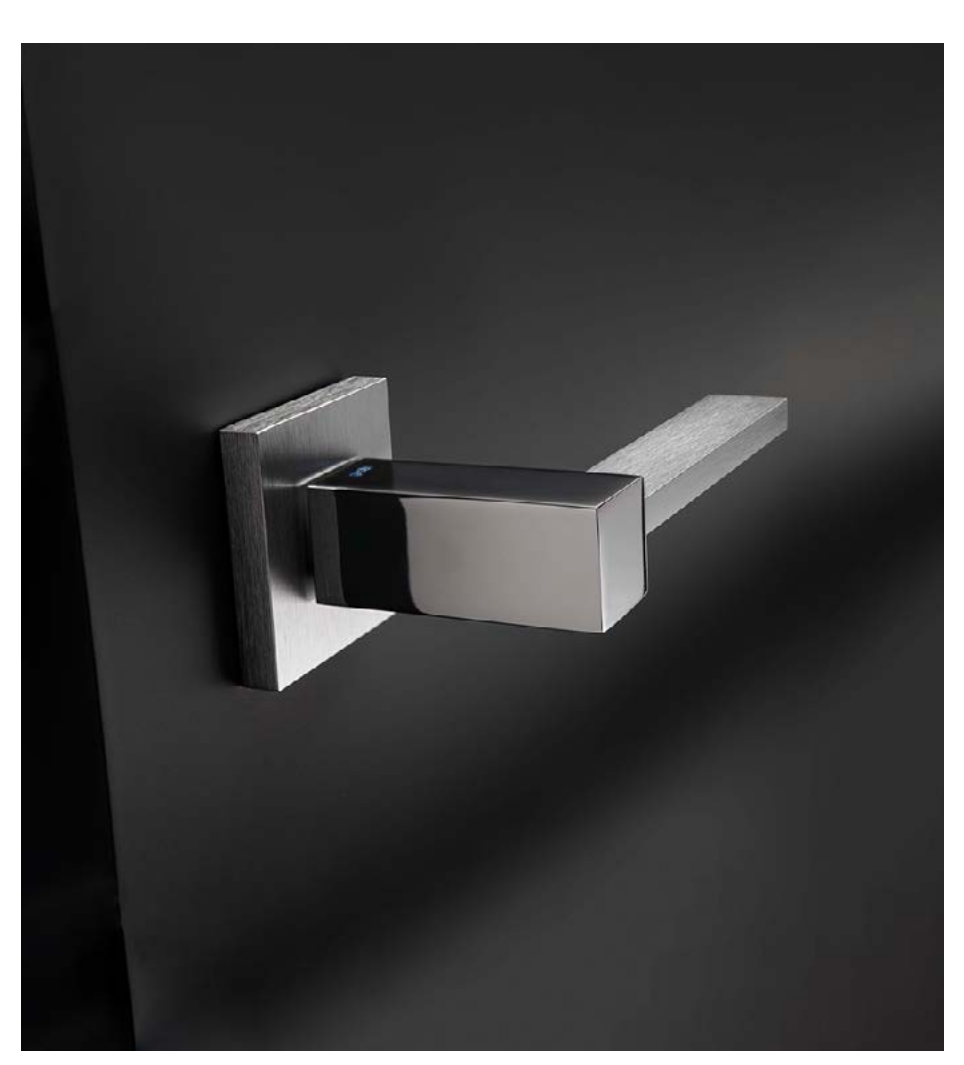
POLISHED CHROME / SATIN CHROME