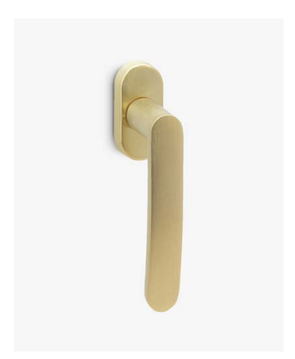
POWERCOAT SATIN BRASS