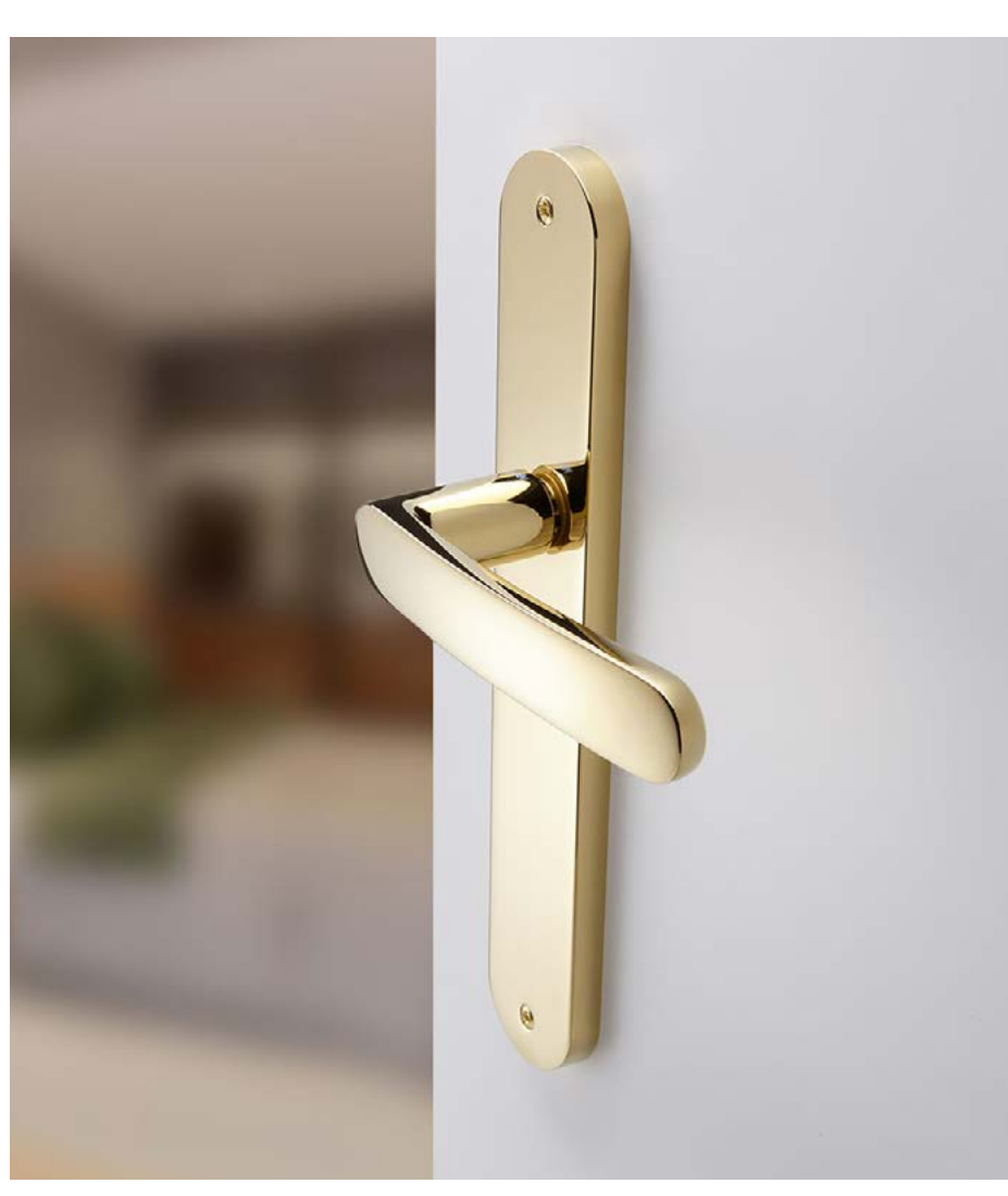
POWERCOAT POLISHED BRASS