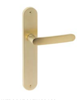
POWERCOAT SATIN BRASS