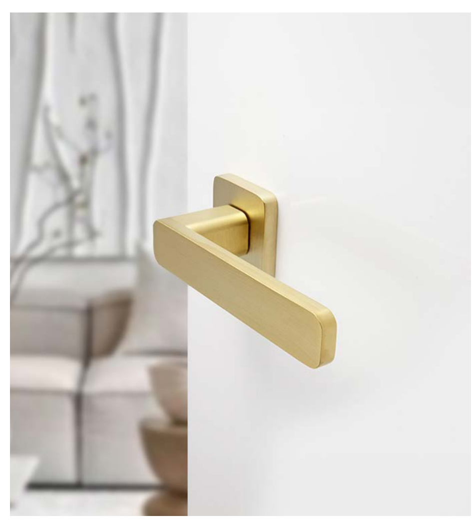
POWERCOAT SATIN BRASS