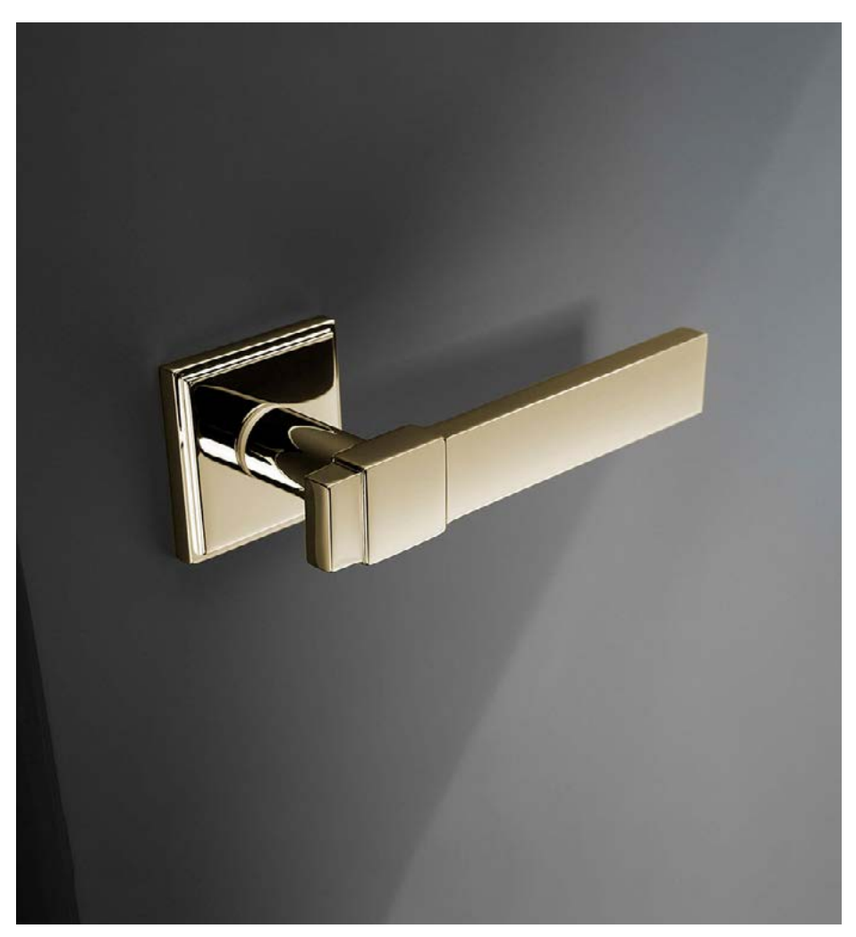
POWERCOAT POLISHED BRASS