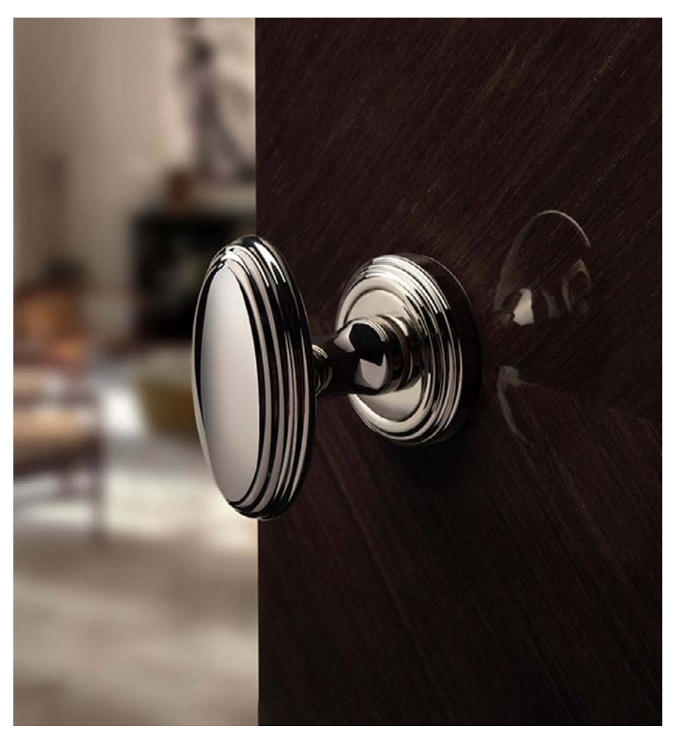
POWERCOAT POLISHED NICKEL