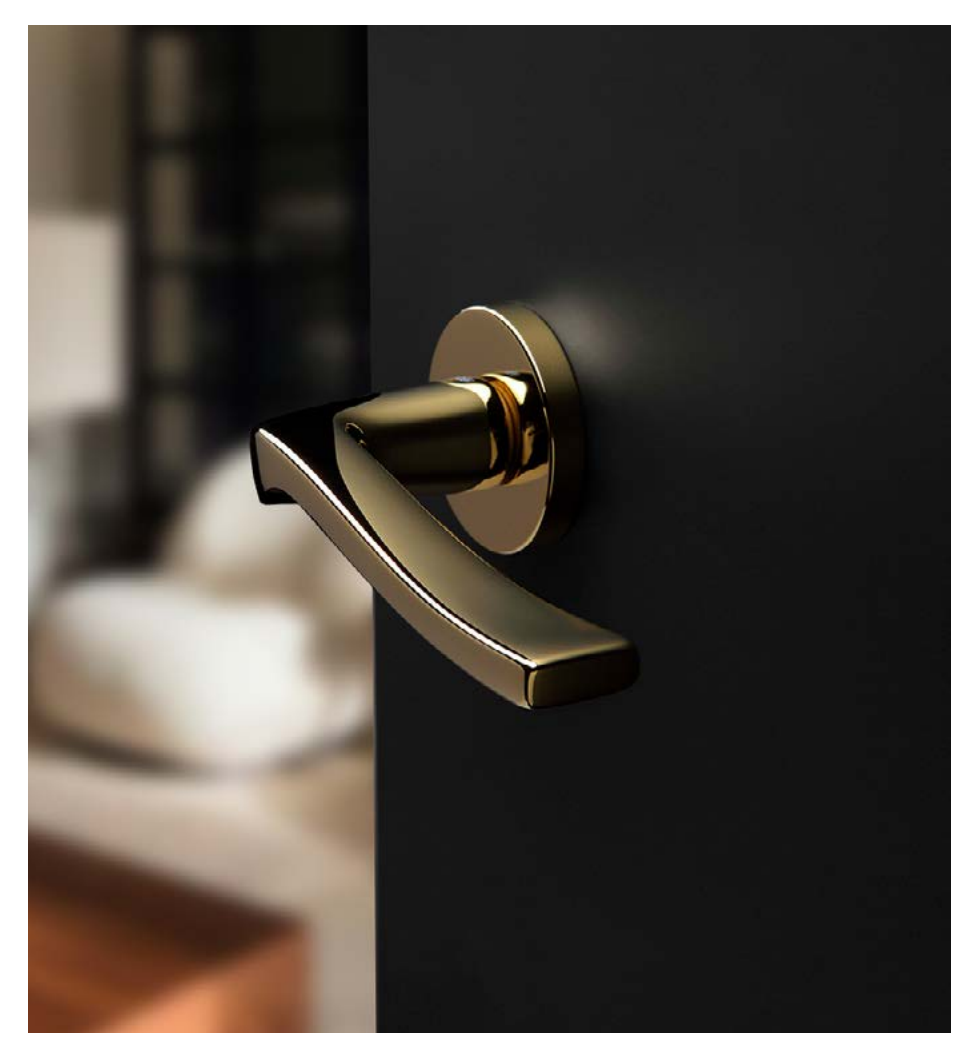
POWERCOAT POLISHED BRASS