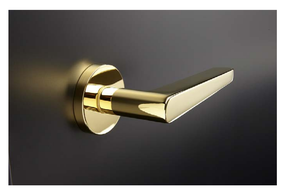
POWERCOAT POLISHED BRASS