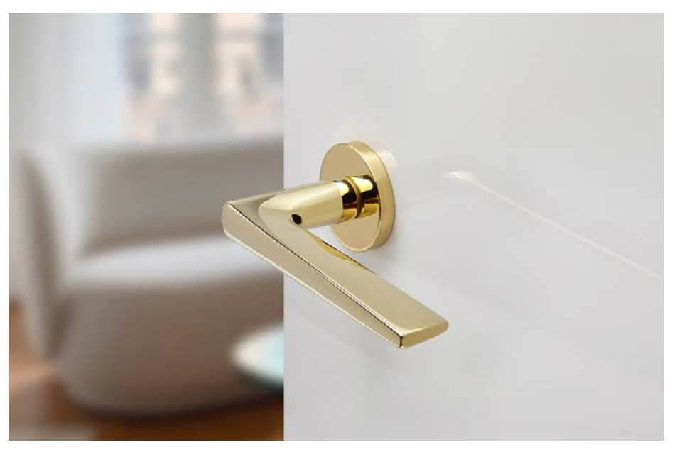
POWERCOAT POLISHED BRASS