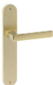
POWERCOAT SATIN BRASS