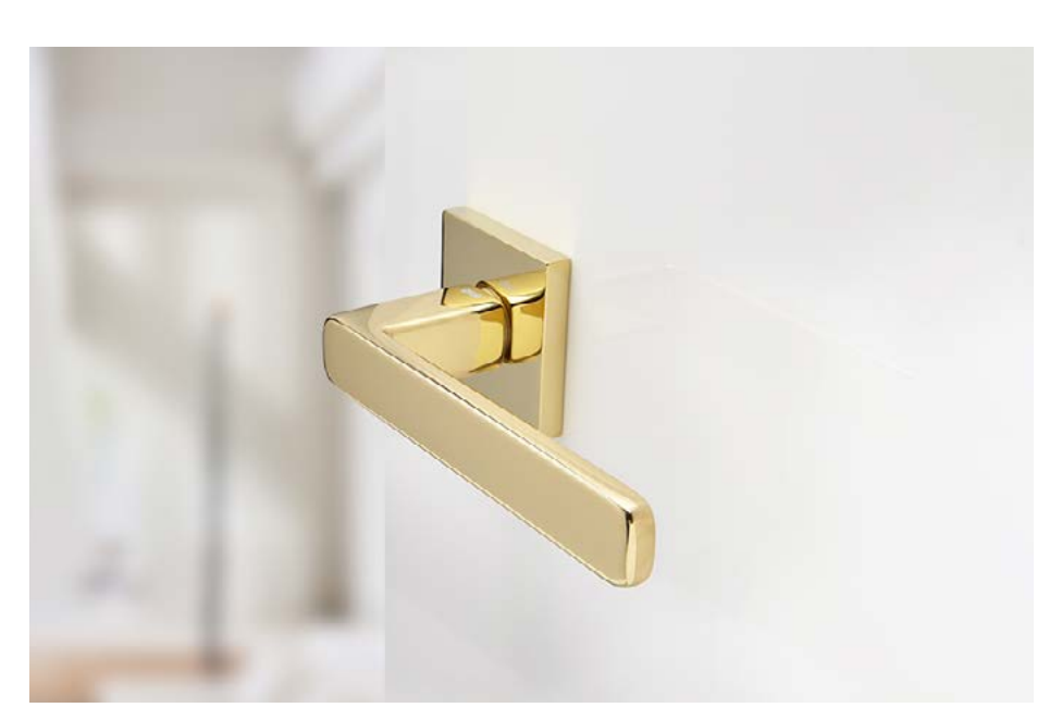
POWERCOAT POLISHED BRASS