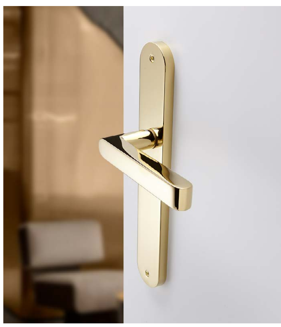
POWERCOAT POLISHED BRASS