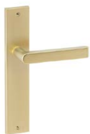
POWERCOAT SATIN BRASS