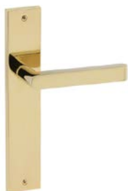
POWERCOAT POLISHED BRASS