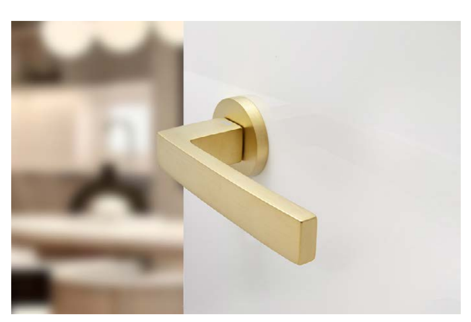
POWERCOAT SATIN BRASS